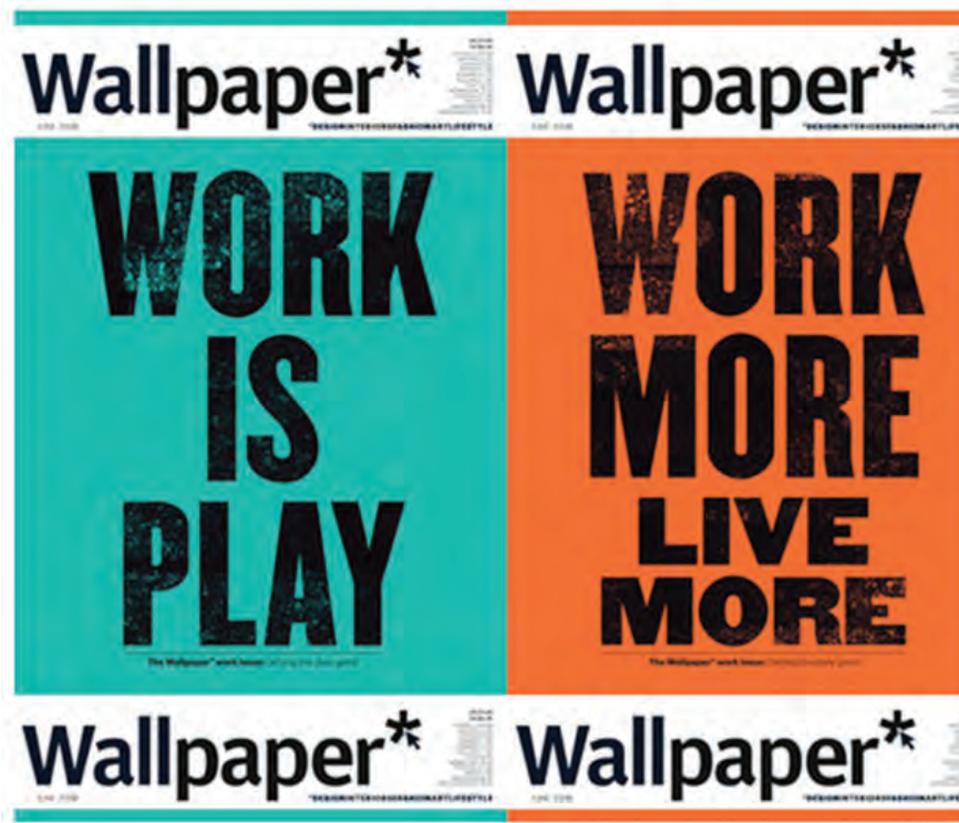
Figure 3: Cover images of Wallpaper magazine no. 111 (2008), presenting an ideological message (full page reproductions available at http://www.wallpaper.com/covers/limited-edition/work-is-play/52#nav ).