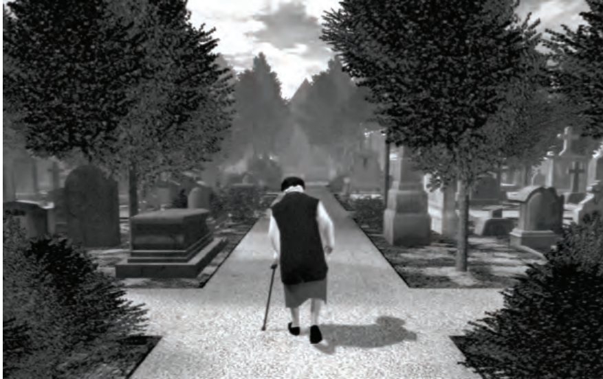
Figure 6: Screenshot from The Graveyard (2008), Tale of Tales .

spectacle (Morgana 2007). Morgana removed the weapons from the level and has the player-pawns attack each other in a ridiculous massacre without player-based gameplay objectives or other constructive teleological human-player commitment. The game exemplifies the opposite of gamification. Other than the ideological suggestions that we can change the world by playing and by using gamified decision-making mechanisms, this game demonstrates clearly that we are just a pawn in the game of an automated market, automated wars and of an automated society. What the artist Morgana renders nicely in front of the beholders' eyes is a (games-)world that contains actors who have to work ceaselessly without achieving anything for themselves or for others. The actors in Morgana's game work like the users of Farmville or any other gamification apps work when they think they play.