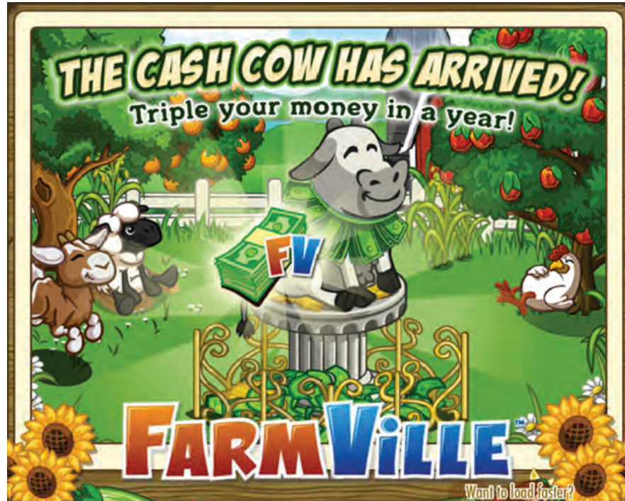
Figure 4: Screenshot from Zinga's Farmville app.

Adorno's main critique of Huizinga culminates in the statement that