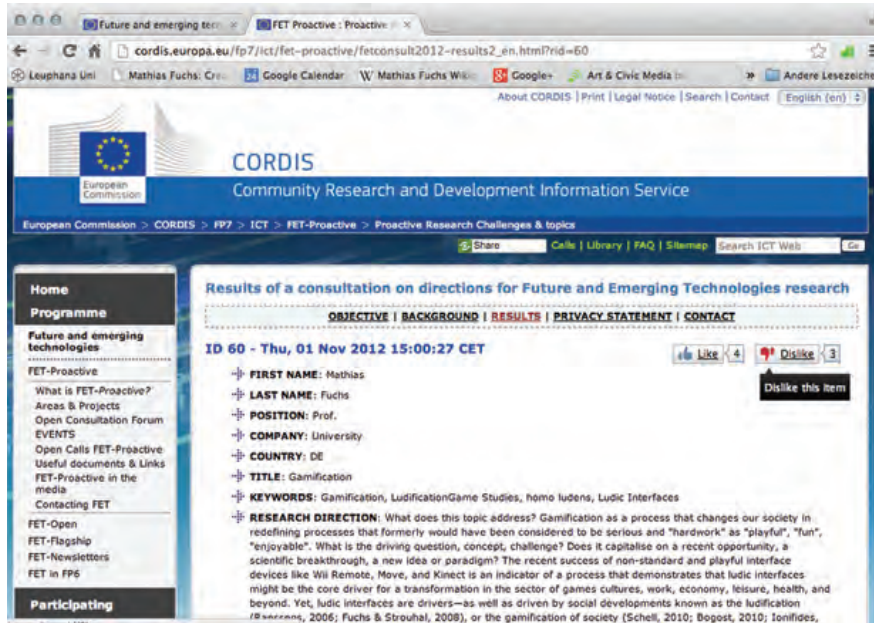
Figure 1: Consultation on directions for Future and Emerging Technologies (screenshot from http://cordis.europa.eu/fp7/ict/fet-proactive/fetconsult2012-results_en.html ).

uses the familiar 'Like' and 'Dislike' buttons that we know from social media and social gossip pages and that we can attribute to the style and methods of gamification. How can one find out whether scientific cutting-edge research is of relevance by asking competitor scientists whether they would put their thumbs up or down? There are many problems with such a method: Conflict of interest is one, reproducibility of data is another one, and a logic circle is a third problem. As evidenced in Figure 1, the question of whether gamification is a relevant research topic is asked with a gamified method. This is as if the Academy of Sciences were trying to find out whether the method of reading tealeaves is a valuable scientific approach by reading tealeaves.